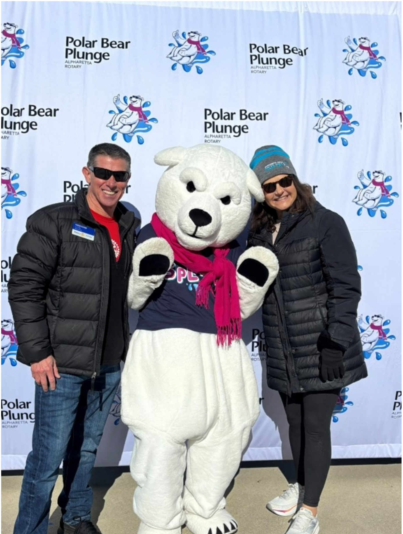
Posted by Gail LaFleche February 25, 2026