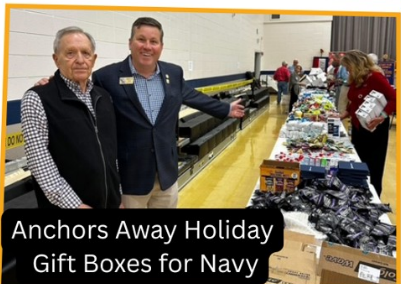
Anchors Away Holiday Gift Boxes for Navy