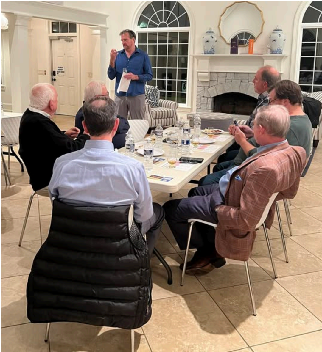
Posted by Bob O'Brien November 4, 2025