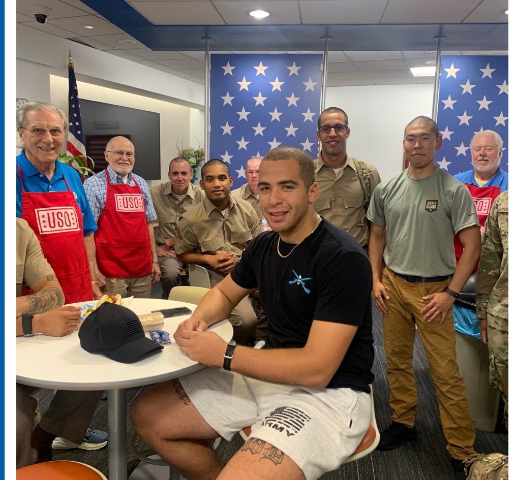
We will serve our service personnel and family members an "All American" lunch of hot dogs with all the condiments, potato chips, fresh fruit, snack bars, home baked cookies bottled water plus a portion of baked Ziti & Mom's meatballs.

We would like to have a total of eight volunteers for the day from 9 AM to 3 PM. Duties vary from greeter, cookie packer, hot dog grill mate, server, bag monitor among other to do items that need to be done to serve our military service personnel.