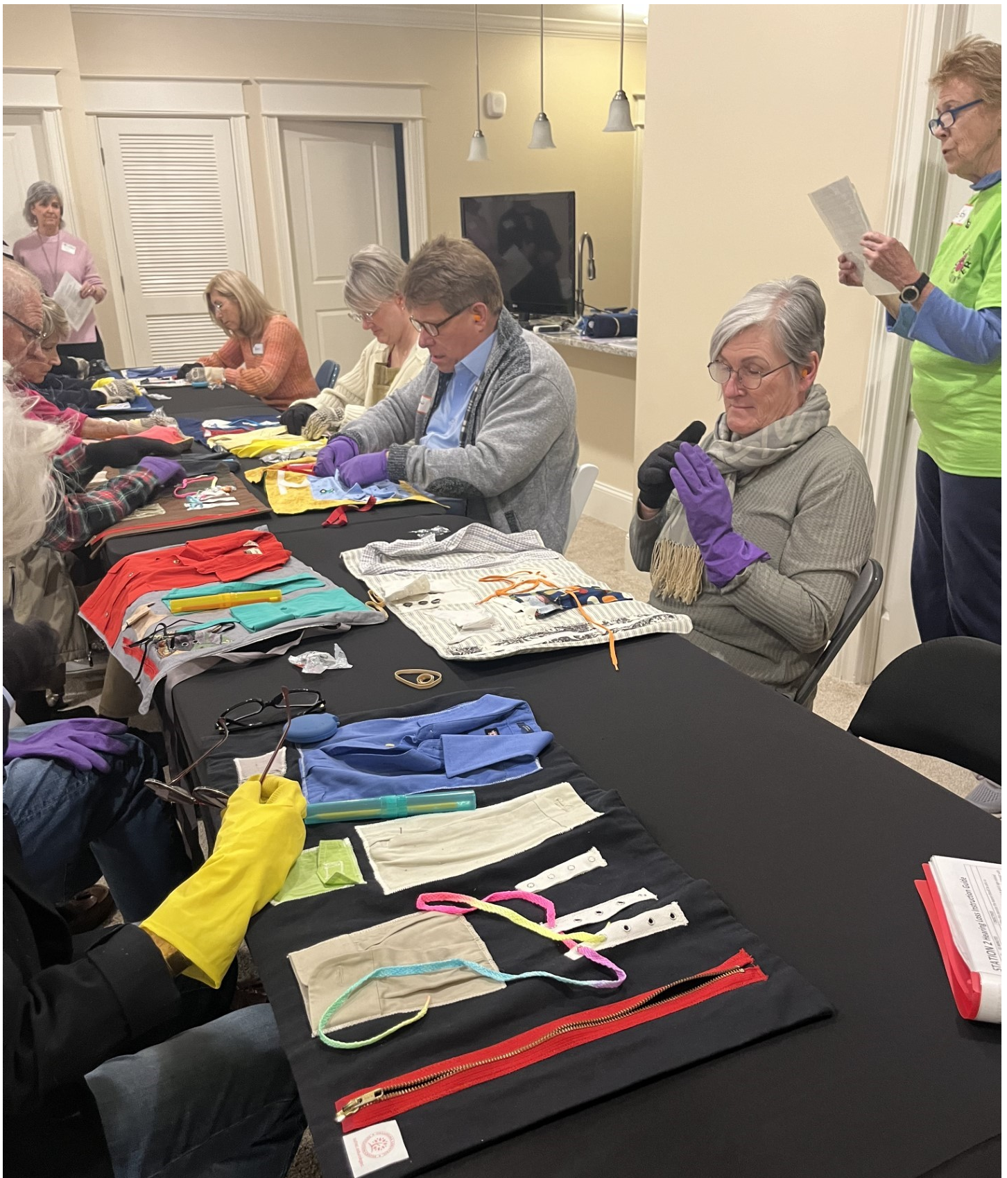
Posted by Nancy Prochaska January 30, 2024