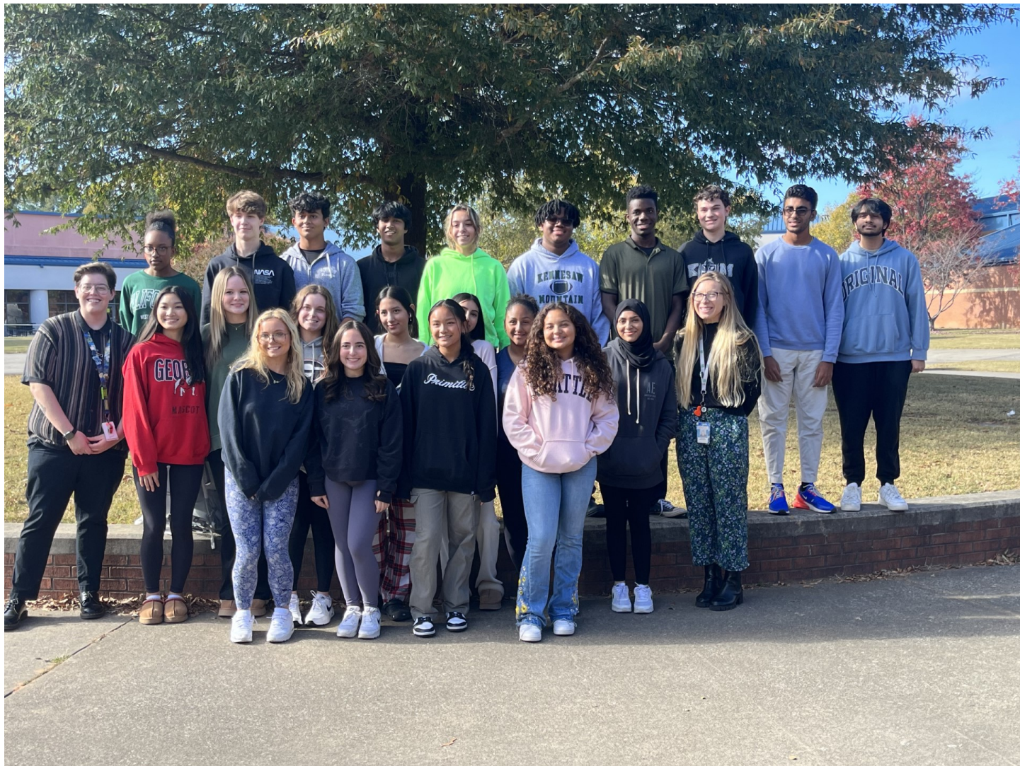
Posted by Nancy Prochaska October 28, 2023