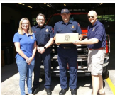
Rotary Club of Columbus The Rotary Club of Columbus is a local organization that is dedicated to serving the community. The club is made up of members from various backgrounds and professions who come together to support local projects and initiatives. The club is a great resource for anyone looking to get involved in their community.