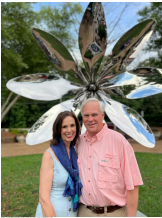
The "Biggie" What We Can Do Together This Year! The "Biggie" is a sculpture of a flower, created by artist Robert Rauschenberg. It is a large-scale work of art, made of metal and painted in vibrant colors. The sculpture is located in the courtyard of the University of California, San Diego. It is a popular spot for visitors to take photos and enjoy the view.