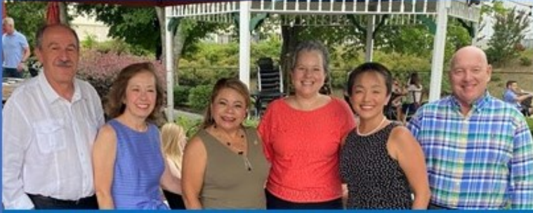
Atlanta Brasil – celebrating three-year anniversary