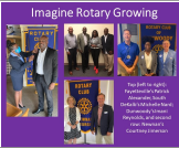
Imagine Rotary Growing Imagine Rotary Growing is a program that provides training and support for young professionals. The program is designed to help young professionals develop their leadership skills and gain experience in the workplace. It is a great opportunity for young professionals to learn from experienced leaders and to build a strong network of contacts.