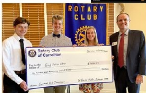
Above: Carrollton Rotary extends Many, many thanks to the Central High School Interact Club for its donation to our End Polio Now campaign!