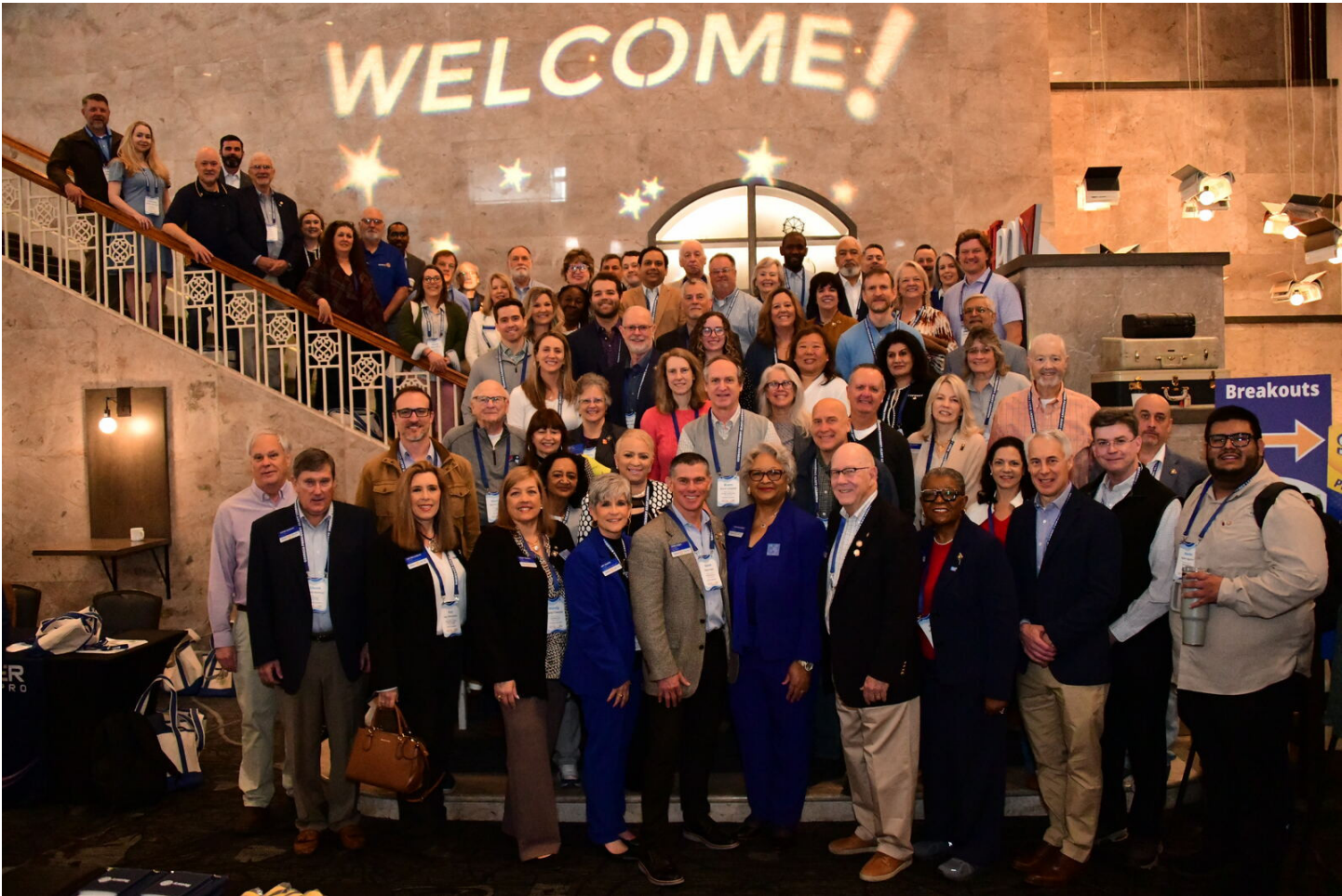
Peach State PELS - training our leaders for the 2026-27 Rotary Year