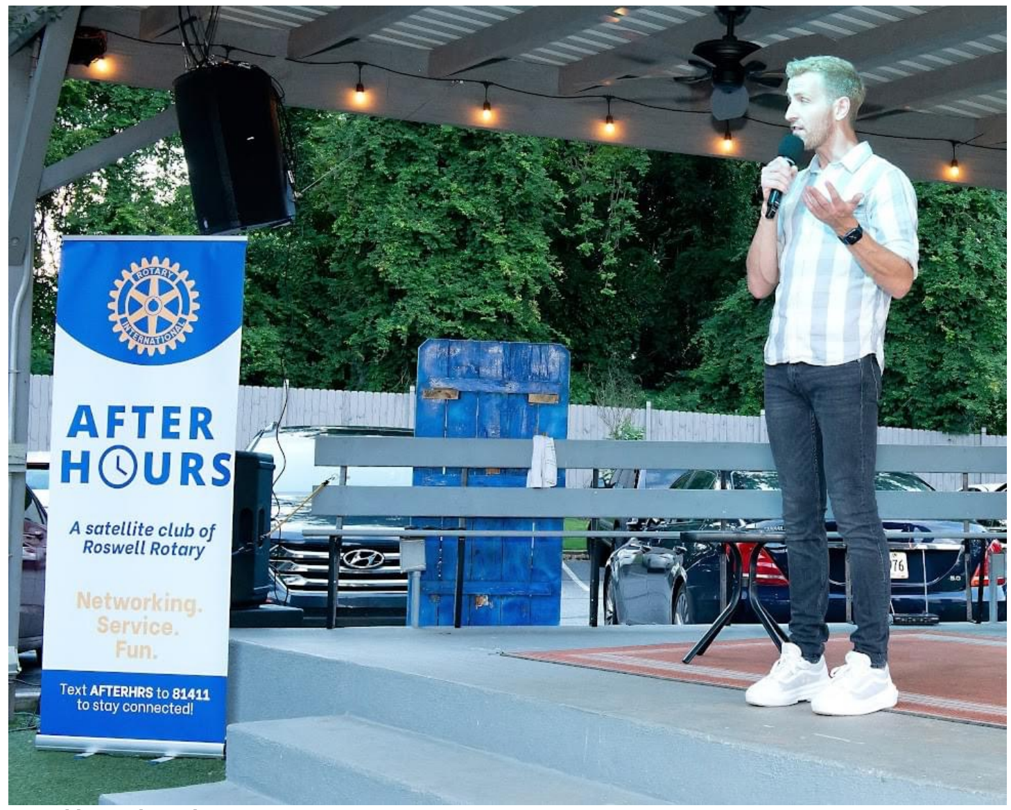
Posted by Becky Nelson July 5, 2023